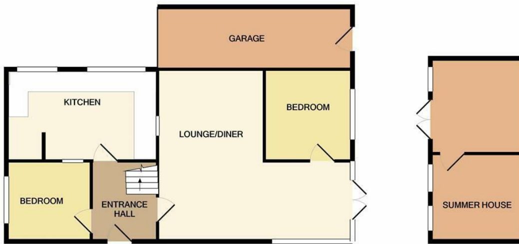
GROUND FLOOR APPROX. FLOOR AREA 923 SQ.FT. (85.7 SQ.M.)